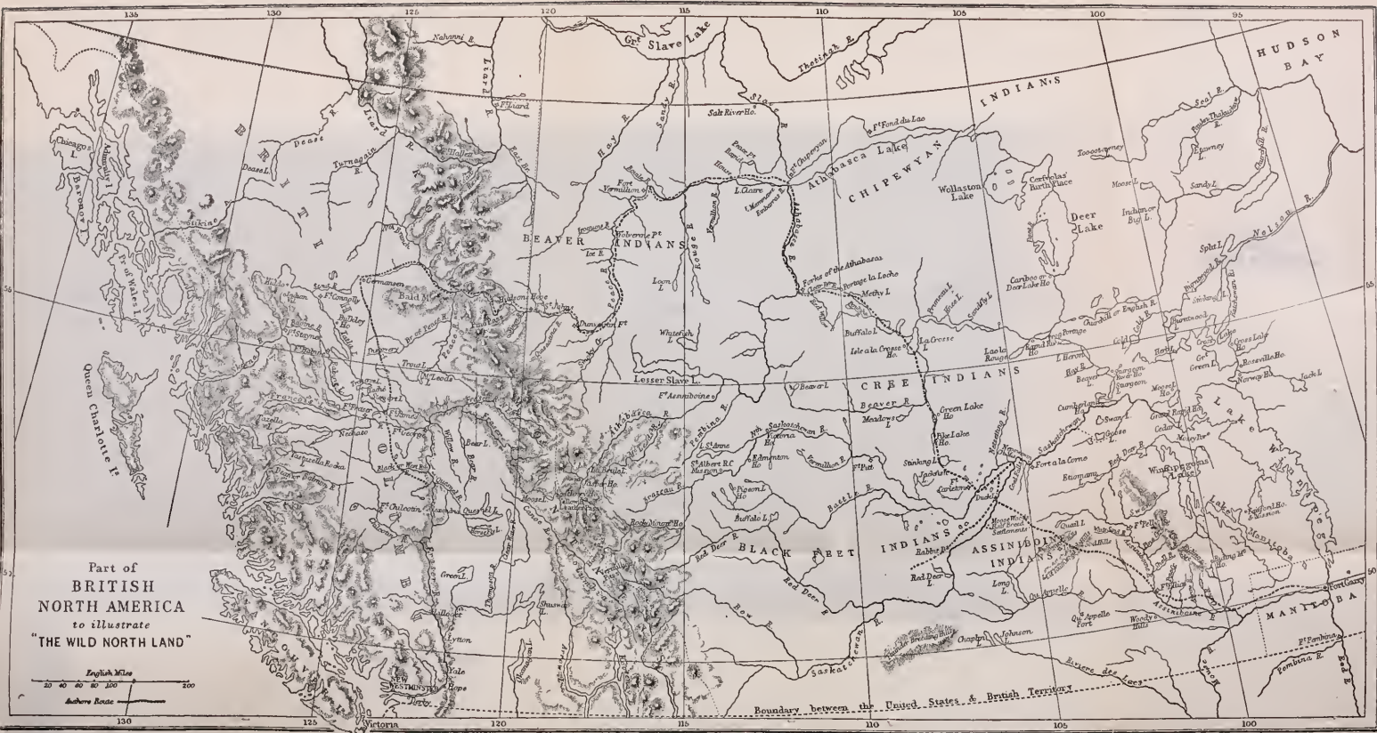
Part of BRITISH NORTH AMERICA to illustrate "THE WILD NORTH LAND"